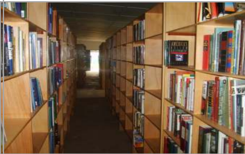
Many more stacks and books!!!!