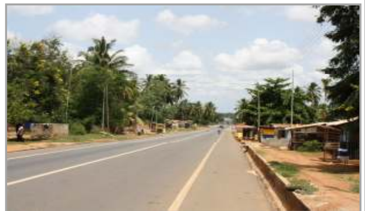
The main road through Akatsi shows excellent improvement!! Perhaps our lessons about not throwing trash on the streets are paying off....