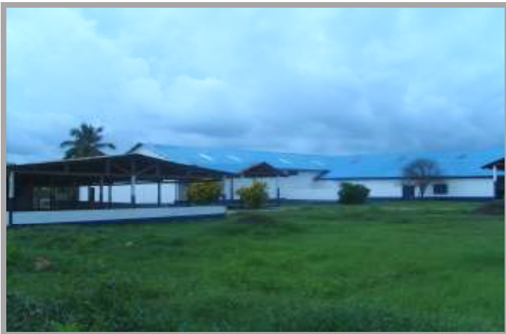
Part of the Physical Facility of the HFLA

There is still much to be done in order to open the doors to students. We hope to start classes in October 2009 if the National Accreditation Board (NAB) gives us the required permission to operate as an institution of higher learning in Ghana. We look forward to the granting of this permission to move forward. We will keep you posted regarding progress in this area. The granting of the permission to move forward depends on the NAB's assessment and approval of our proposed university degree programs, course descriptions, and the physical building (take a look at the following pictures).